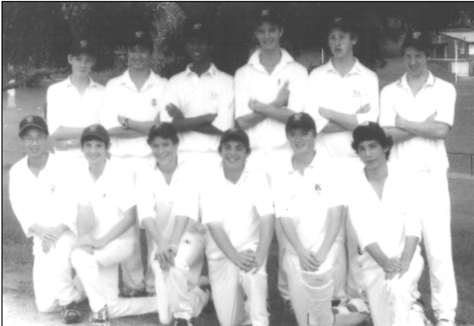
Balwyn U16B AR Tongue Shield 2005-06 Premiers