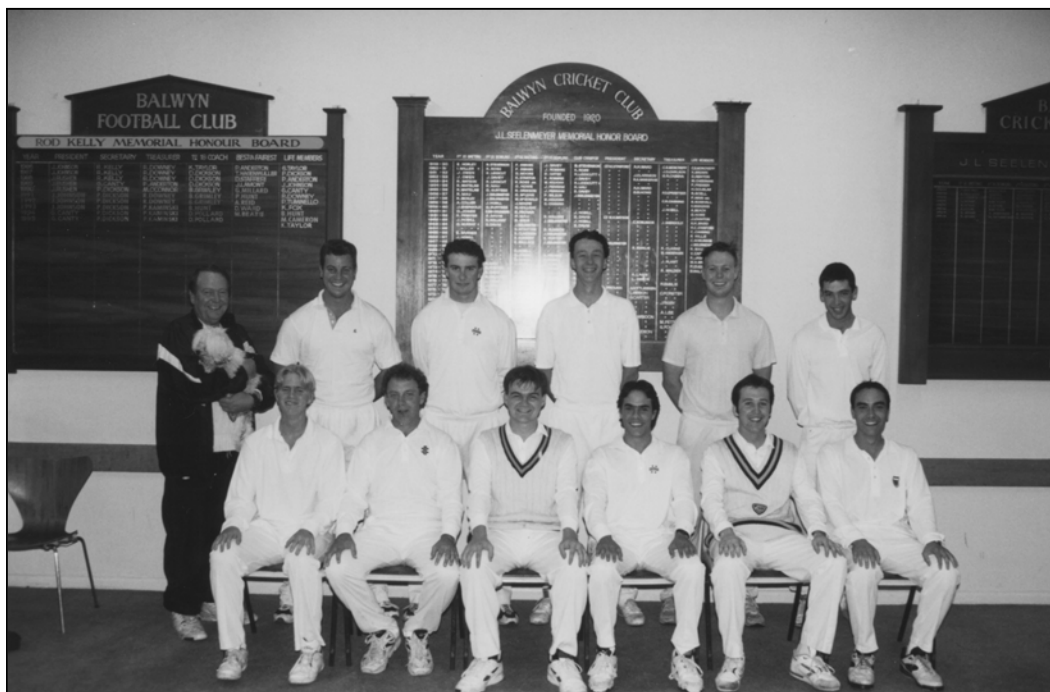
Below: 1996-97 4 th XI Premiership Side (ESCA – G Grade)